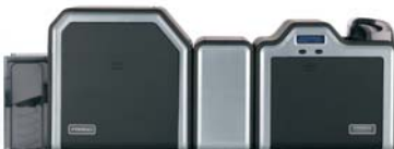
Lamination option and dual-sided printer/encoder

Modular design grows with your needs. Not sure what your ID card applications will require in the future? No problem. The HDP5000 is easily upgraded to fit your needs. Start with a basic single-sided unit. Install encoding modules. Upgrade to dual-sided printing. Add lamination, or simultaneous dual-sided lamination for the ultimate in card security and durability.