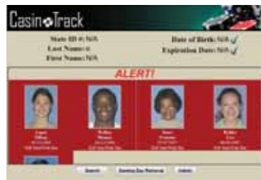
Barred Player Alert