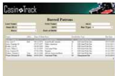
Barred Player Listing